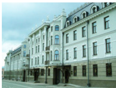
Internal Affairs Ministry, RT