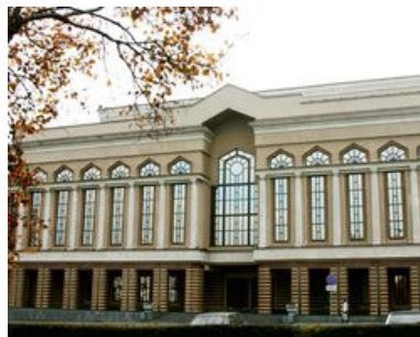
Conservatory Concert Hall named after S.Saydashev, RT